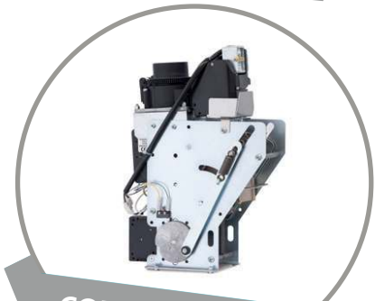
COFFEE BLADE WITH CONIC GRINDERS