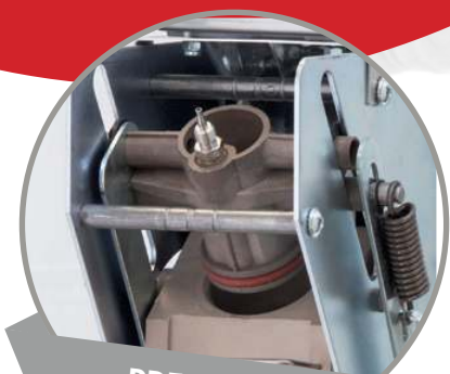
PRE-HEATED INFUSER GROUP